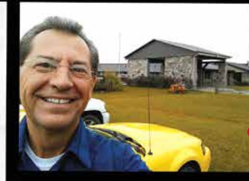
▶ WARNER FACILITY WHERE IT ALL BEGAN.